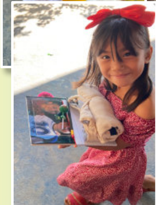
We give out the gifts and get lots of smiling faces