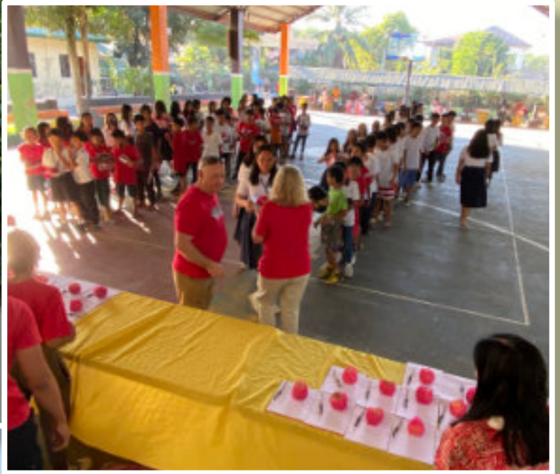
The students wait patiently as the gifts are given out