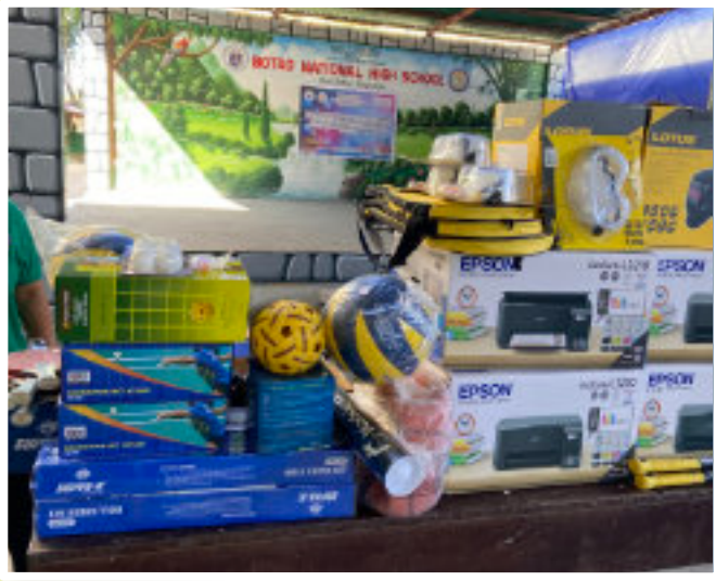
Sports supplies for the high school