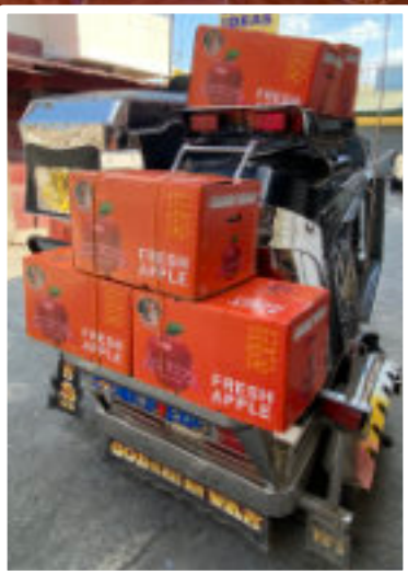
We collected the apples for the students on our tricycle!