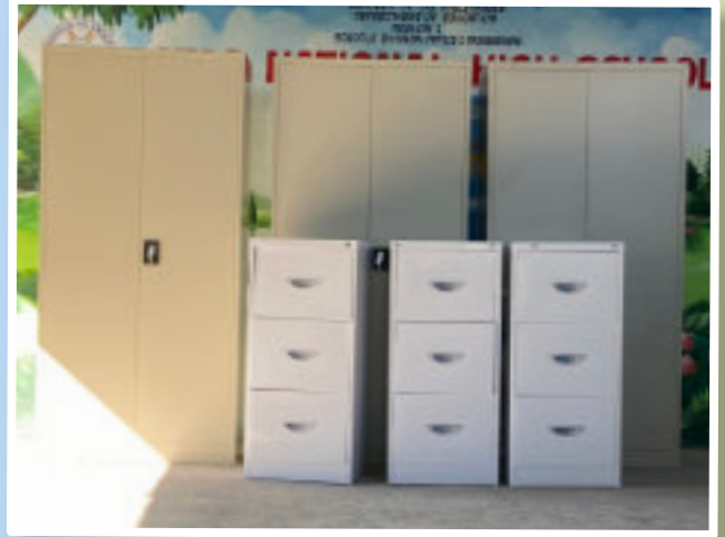
Lockers and cabinets for classrooms