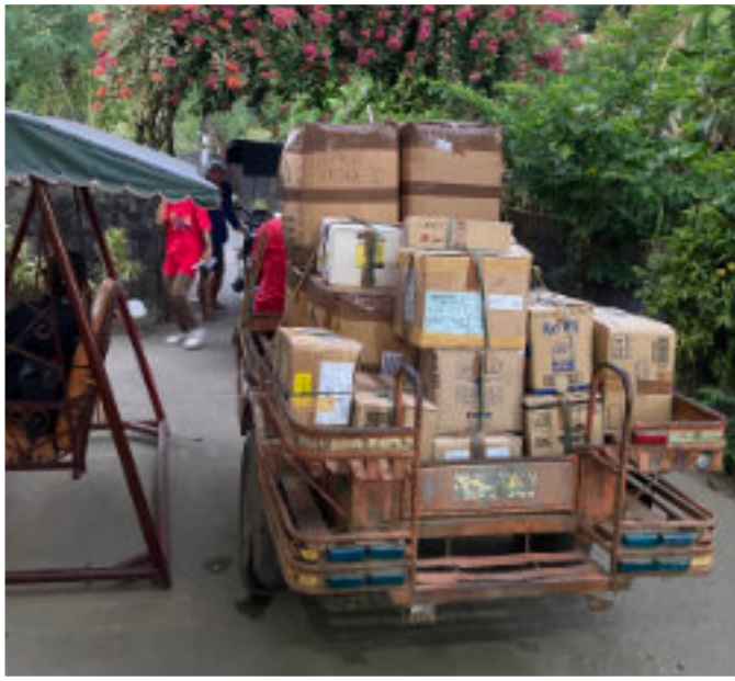
Our tractor is loaded with all the gifts we will give away today.